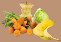
Fruit and vegetable peelings

Bioabfall // Biyo atıklar // Биомусор // Bioodpady // Les déchets biodégradables // النفايات العضوية