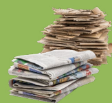
paper and cardboard