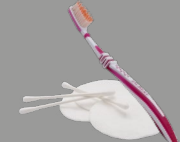
Sanitary and hygiene products